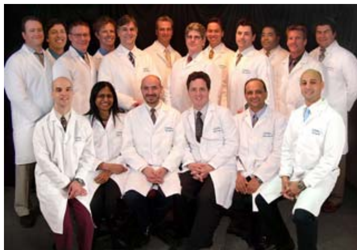
A preview of the new interview panel for specialist training selection

How much notice will I be given for my ST1/2/3 interview? 48 hours (via MTAS email)