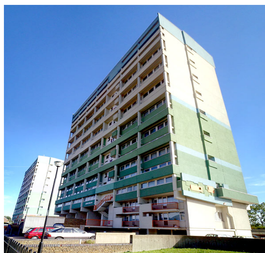
East Ham: The best place in the world to be stabbed in. By a happy coincidence it is also one of the most likely places to be stabbed in.